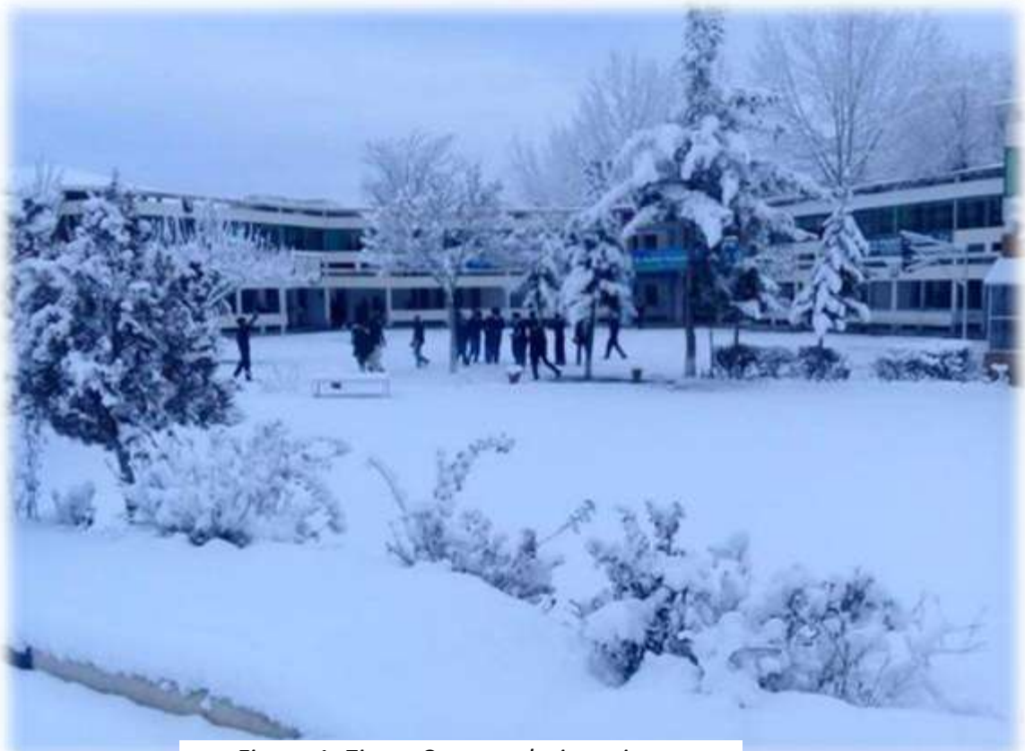
Figure 1: Ziarat Campus during winters

For the purpose, this year Al Hijrah's leadership approached KIPS Academy and Akhuwat Foundation to build partnership for supporting winter camp and exposure visit of Al Hijrah's Students in Punjab province during winter vacation. Akhuwat Foundation agreed to provide residence at Akhuwat College Kasur while KIPS Academy accepted to provide teaching faculty for revision and completion of FSc syllabus/courses. 56 students of Intermediate level classes along with two faculty members and two administrative staff members had a stay of three months at Akhuwat College Kasur. During the trip the participants from Baluchistan travelled to Lahore, Kasur, Islamabad and Murree. In addition to the academic activities, they interacted with various dignitaries, motivational speakers and visited famous historic & recreational places