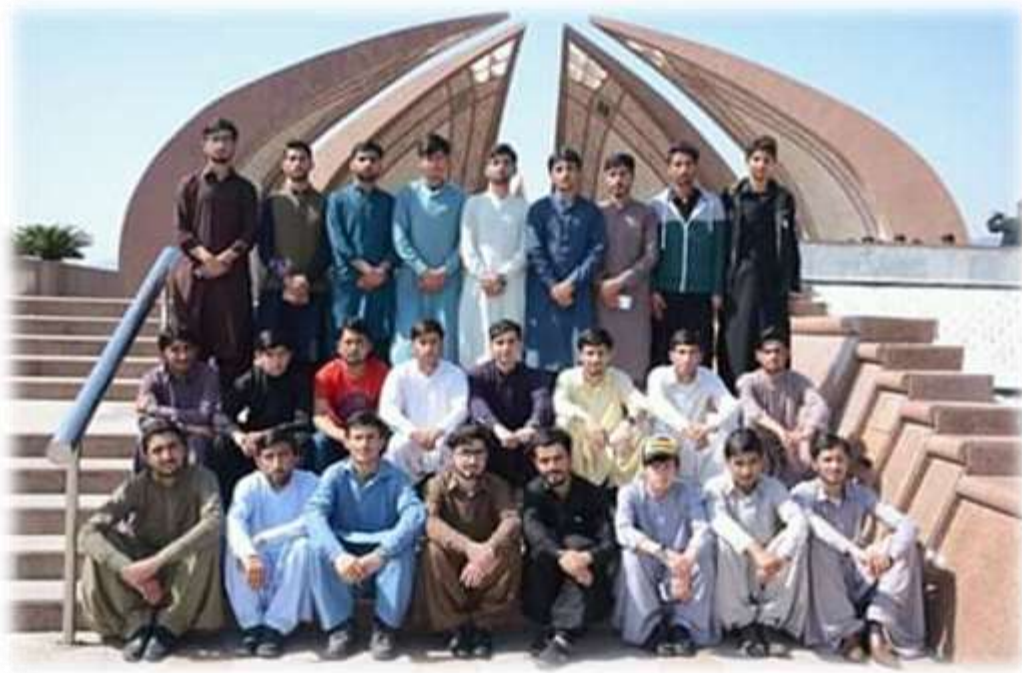
Figure 12: Students at Various Historic and Picnic Places