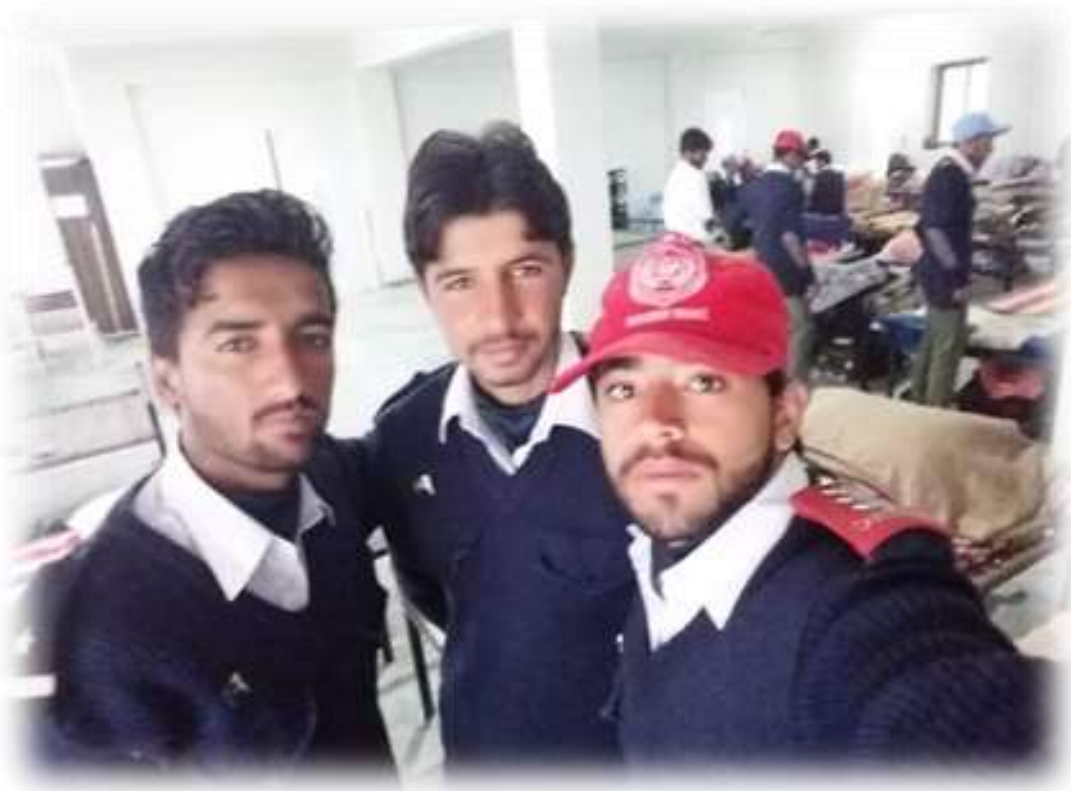
Figure 10: Participant in Residential Hall provided by Akhuwat College Kasur

Classes of science subject were held in the evening while during the morning time students were engaged in classes of Islamic Studies, Urdu and English taught by Al Hijrah's faculty. During the day time students were engaged in self-study. Almost entire syllabus was revised under the instructions of teachers provided by KIPs. The learning process was facilitated through quizzes, assignments, group discussion/activities and sample board papers with special focus on developing capabilities of student to achieve high marks in board exams and attempt entry test for engineering and medical.