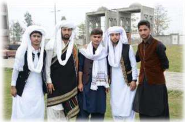
Figure 7: Student Wearing Baloch Cultural Dress at Cultural day during Camp at Kasur