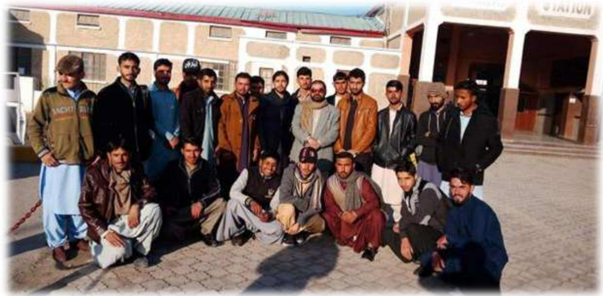
Figure 5: Participants at Quetta Railway Station before leaving for Lahore

Al Hijrah selected two senior classes consisting of 56 students of Intermediate part 1 and part 2 for the winter camp. In morning of January 24, 2019, the students along with two faculty members and two administrative staff members travelled via train from Quetta to Lahore. Majority of the student were travelling for the first time to another province and especially to the historic city of Lahore. After travel of a full day and night the participants reached Lahore. The participants were received by Al Hijrah Alumni members pursuing higher education in Lahore city. After a short break in Lahore, the Finance and Logistic Manager arranged transport to facilitate travelling to Akhuwat College Kasur that is situated in Mustafa Abad between Lahore and Kasur. Mr Akram and Mr Dogar from Akhuwat College, Kasur received the participants.