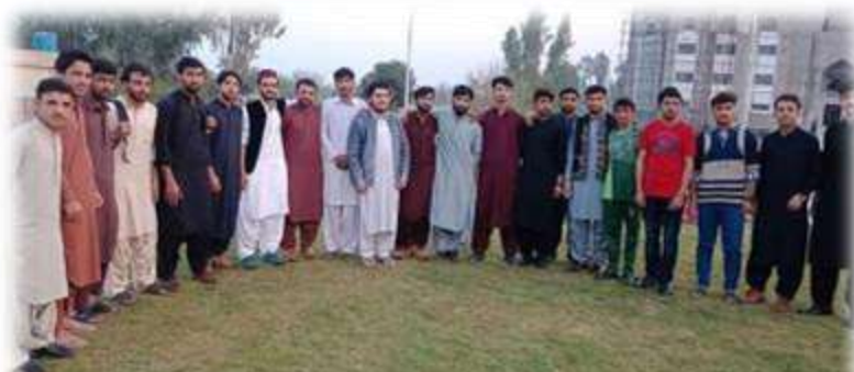
Figure 9: Students at Akhuwat College