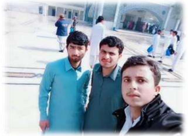
Figure 8: Students at the tomb of Baba Bhulay Shah and Sufi Saint and Poet at Kasur District