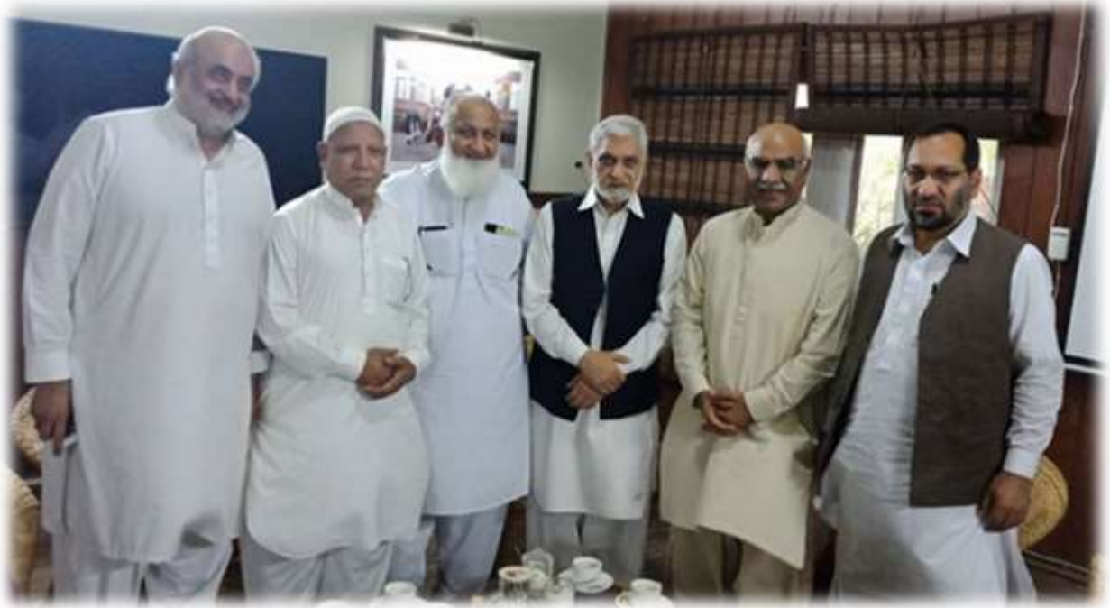
Figure 4: Meeting with Chairman Akhuwat Foundation