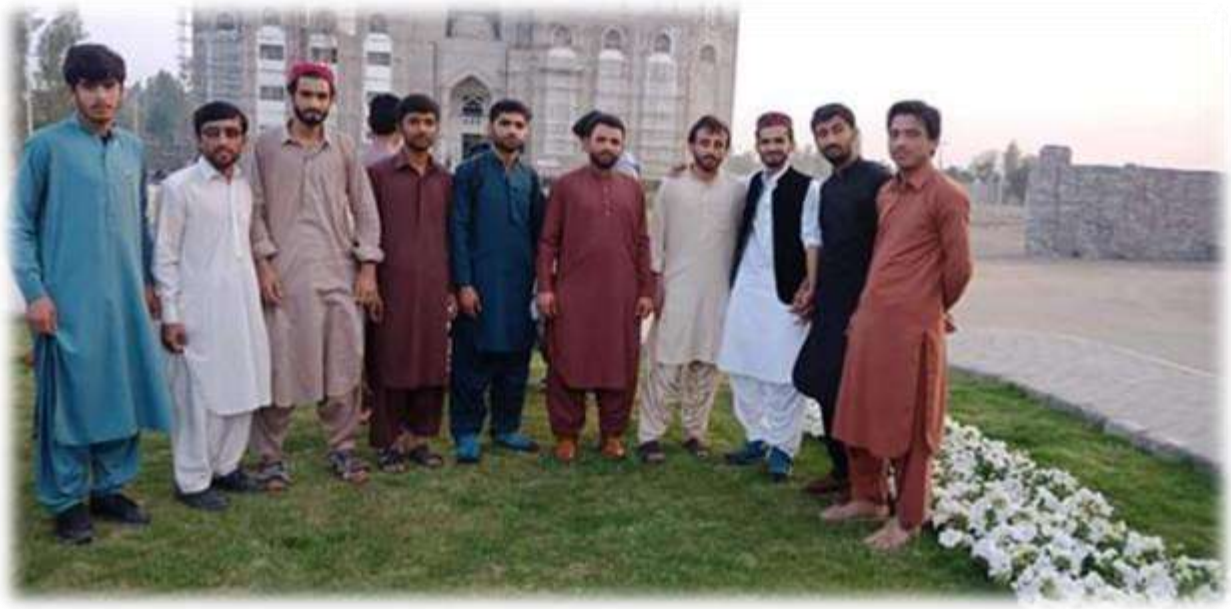
Figure 6: Student at Akhuwat College Kasur